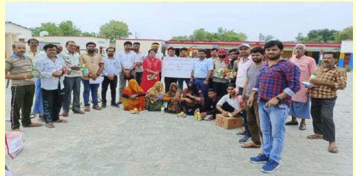
Fig. 9: Distribution of seed & agri-inputs among farmers

Jhansi (25) and Datia (25) district (Fig. 9). The training on Crop production technology of Sesame was also conducted on 30 June 2022 in the villages in which lectures were delivered by the scientists on various aspects (Artika Singh, Vaibhav Singh, Bharat Lal and Ashutosh Kumar)