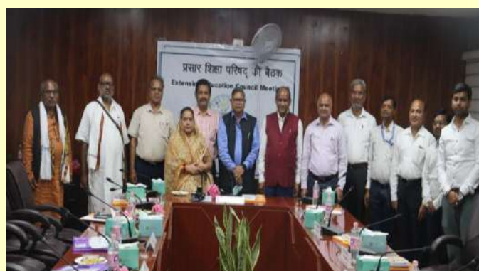
Fig. 18: Second Extension Education Council Meeting