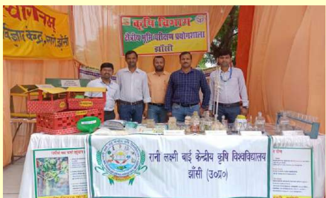
Fig. 16: University participation in the exhibition, Jhansi