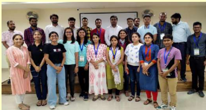
Fig. 15: Inaugural session of workshop