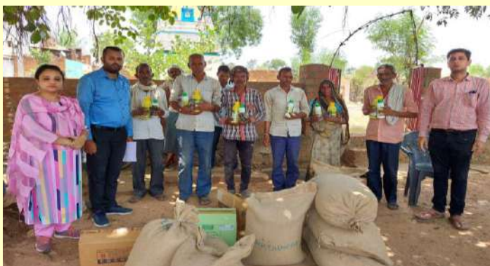
Fig. 8: Distribution of critical inputs among farmers

FLDs is being conducted in the fields of a total of 12 farmers in village Naykheda of Babina block, Jhansi district under the Scheduled Caste Sub-Plan funded by ICAR-IIPR, Kanpur on 25 th June 2022 (Fig. 8). Information about improved cultivation practices of aerobic rice that can perform well under less water along with seeds of aerobic rice variety D.R.R. 42 and D.R.R. 44 and nano-urea and herbicides such as pendimethylene and bispyribac sodium were distributed. (Gunjan Guleria, Nishant Bhanu and M. K Singh).