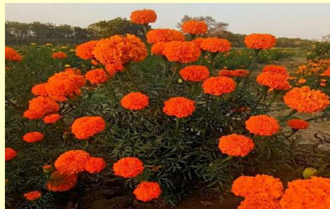
Fig. 2: Flowering of African marigold cv. 'Pusa Narangi Gainda'

that flowers per plant (47.95) were maximum with application of 150 kg/ha nitrogen and 100 kg/ha each of phosphorus and potassium (Figure 1). Similarly, flower yield per plant and flower yield per hectare (556.06 g and 15.87 t/ha) were also recorded maximum with application of 150 kg/ha nitrogen and 100 kg/ha each of phosphorus and potassium. (Priyanka Sharma, Gaurav Sharma & Y. Bijilaxmi Devi).