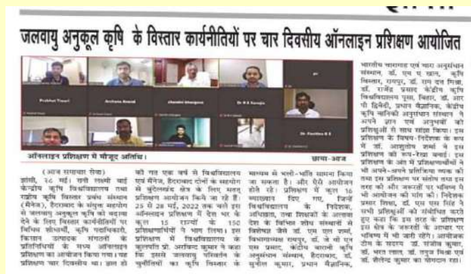
Fig. 12: Media Coverage by local News Paper

This online training was organized in collaboration with MANAGE, Hyderabad by virtual mode for agriprofessionals, extension functionaries, students and field level extension workers during 25-28 th May, 2022 (Fig. 12). More than 110 trainees from different states registered and e-certificate were sent (Ashutosh Sharma, Sanjeev Kumar, Bharat Lal, Tanuj and Shailendra Kumar).