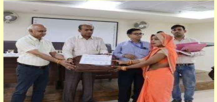
Fig. 13: Distribution of Certificate among participants

seven lectures were delivered emphasizing over cultivation of vegetables, seed production, packaging, marketing, processing, IPM , irrigation management, pollination, role of mulch in cucurbitaceous vegetable production, etc (Fig. 13). Certificates and bags were also provided to farmers. (Arjun Lal Ola, SS Singh, A.K. Pandey, M.M. Dobriyal)