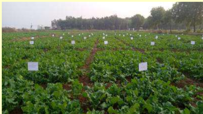
Fig. 1: Field trial of Rapeseed-Mustard

This experiment was conducted in campus, during Rabi 2021-22 under AICRP-Rapeseed-Mustard to evaluate the effect of irrigation, microbes and their combination on the growth and seed yield of mustard. The experiment comprising 18 treatments was conducted following a split-plot design with 3 replications (Fig. 1). The variety 'Giriraj' was sown following standard row and plant spacing. The post-harvest data is being recorded. (Artika Singh Kushwah).