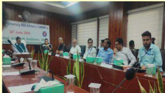
Fig. 5: Meeting of NSS Advisory Committee

responsibility of its maintenance during the degree programme.