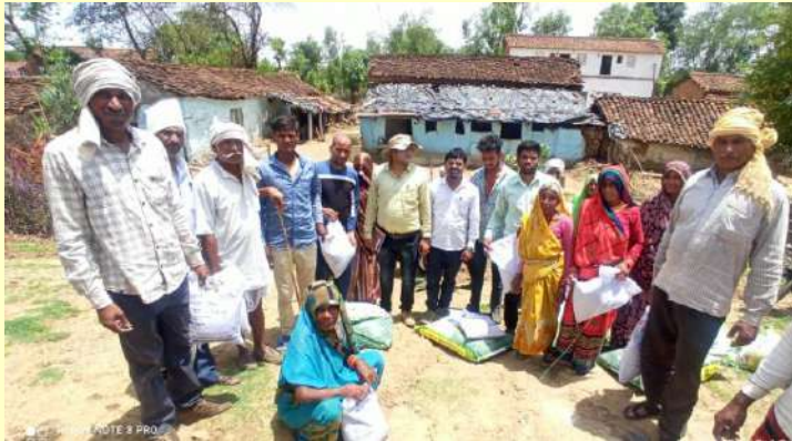
Fig. 7: Distribution of Seed and Fertilizers

FLDs among 121 farmers of Schedule Caste from village-Simardha & Khaikheda of district Lalitpur Uttar Pradesh were organized where inputs like Urd seed (IPU13-1) and Fertilizer (Single Super Phosphate-one bag) were distributed for demonstration purpose on one acre of land (Kharif-2022) sponsored from ICAR-IIPR, Kanpur on 22 June 2022 (Fig. 7) (Meenakshi Arya, Anshuman Singh, Arpit Suryawanshi and Sanjeev Kumar).