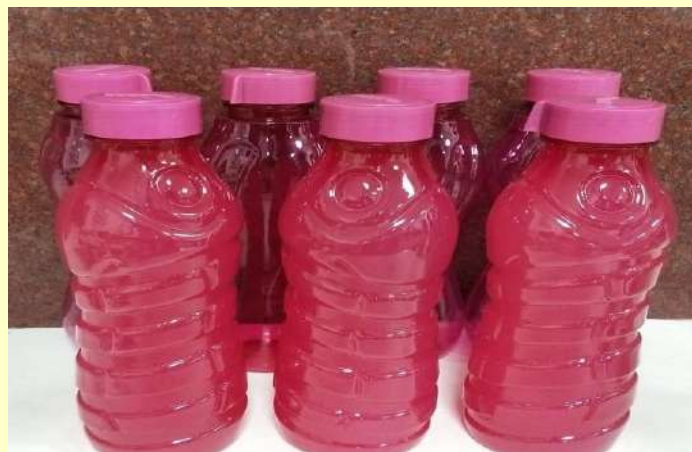
Fig. 3: Pomegranate nectar without artificial colours & flavours

A recipe for the development of pomegranate nectar was standardized for commercial sale in the department of Postharvest Technology. As per FSSAI specification, nectar is a beverage that contains not less than 20 % fruit juice or pulp, 15% total soluble solids and not more than 1.5 % titratable acidity as citric acid (Fig. 3). White and red fleshed pomegranate varieties were procured from the Fruit Science demonstration farm of the university. The white-fleshed varieties were high in TSS (sweetness) and the red-fleshed varieties had an attractive deep red colour. The blend of juices from these varieties had the desired sweetness, colour, flavour and Overall acceptability on a 9-point Hedonic scale (Ghan Shyam Abrol, Ashwani Kumar and Gaurav Sharma).