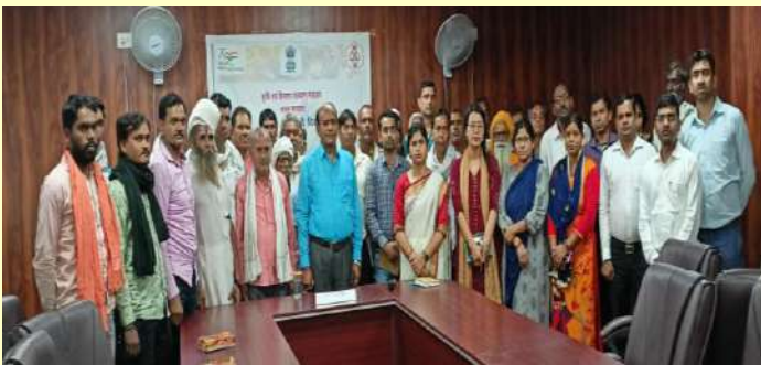
Fig. 11: Incampus Training of Honeybee growers and farmers