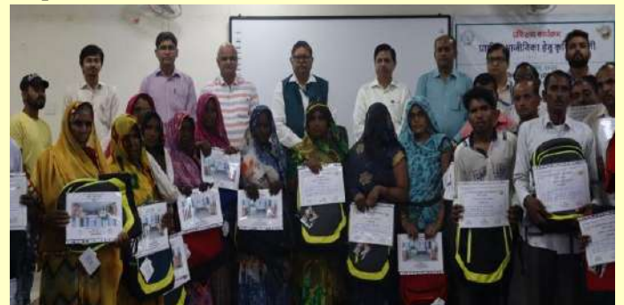
Fig. 14: Distribution of Certificate

The Training was conducted during 15-20 th June, 2022 for the farmers in the campus under RKVY through the project Establishment of Hi-tech Nursery for Quality Planting Material of Agroforestry and Plantation Trees in Bundelkhand Region of U. P. Skilled information on forest trees for agroforestry, nursery raising & plantation methods about the various multipurpose tree species like neem ( Azadirachta indica ), teak ( Tectonagrandis ), Gmelina ( Gmelinaar borea ), kadam ( Neolamarckia cadamba ), etc. including bamboo species available in the region. (Drs. Prabhat Tiwari, Manmohan Dobriyal, Ram Prakash Yadav, Priyanka Sharma, & Garima Gupta).